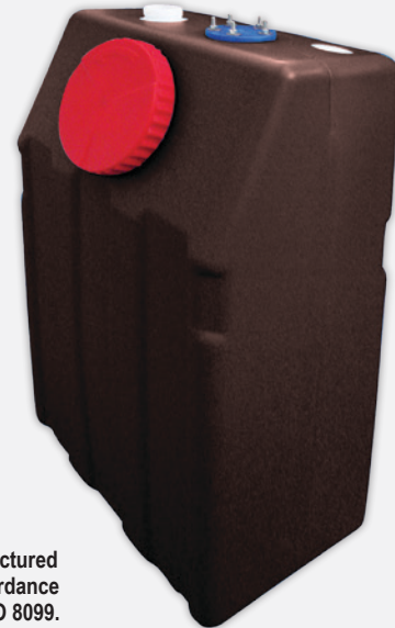
Manufactured in accordance with ISO 8099.